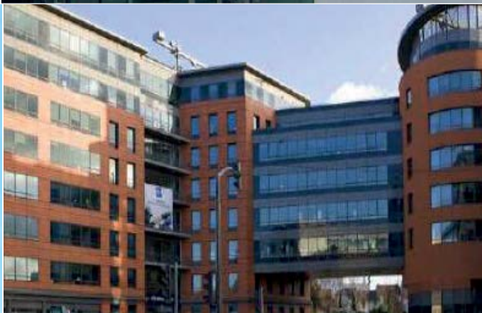
LA PORTE DU PARC - SAINT-OUEN Sale of a 11 663 sq.m of offices - PRIMONIAL to SOGECAP