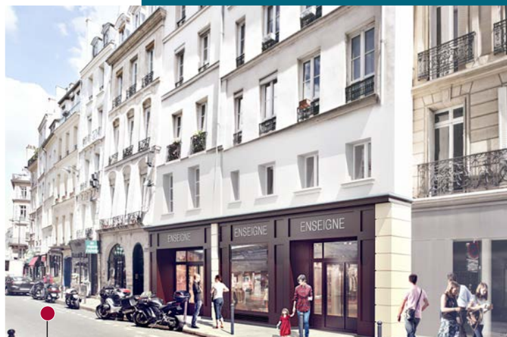
6-8 BD RASPAIL / 62-66 RUE DE GRENELLE - PARIS 7 Sale of 1 519 sq.m of retail - EMERIGE to PRIMONIAL