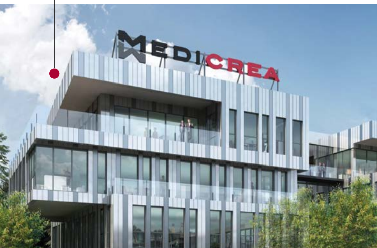
MEDICREA - RILLEUX LA PARE Sale of 7 783 sq.m of offices (“VEFA”) 6 EME SENS to MUTUELLE EPARGNE RETRAITE