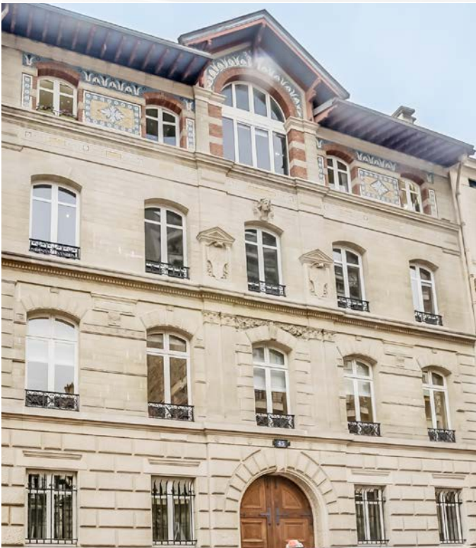
38 / 38 BIS RUE BOISSIÈRE - PARIS 16 Sale of 798 sq.m of offices - TERROT to PREVOIR