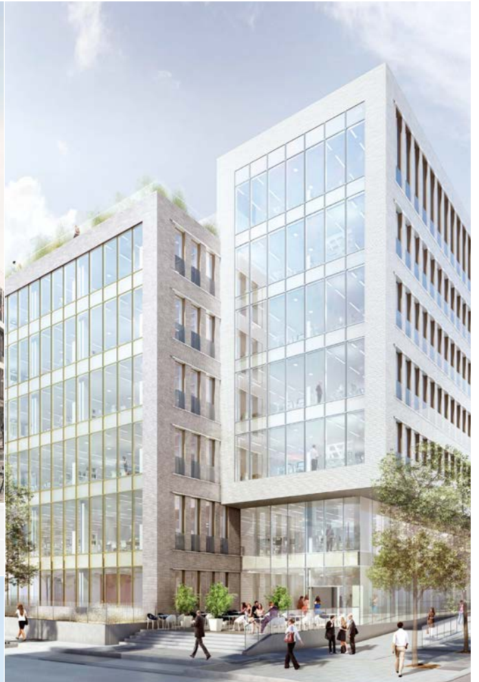
ART & FACT 2.0 - RUEIL MALMAISON Sale of 16 250 sq.m of offices ("VEFA") - BOUYGUES / BNP to CREDIT AGRICOLE ASSURANCES