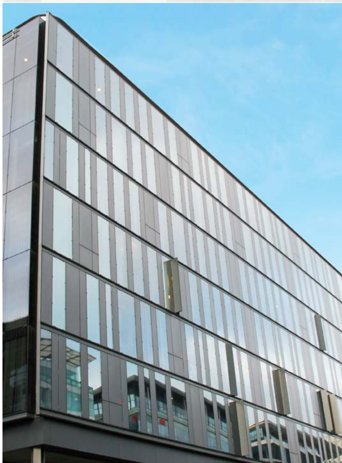
M7 - PARIS 13 Sale of 17 450 sq.m of offices - MEAG to SOGECAP