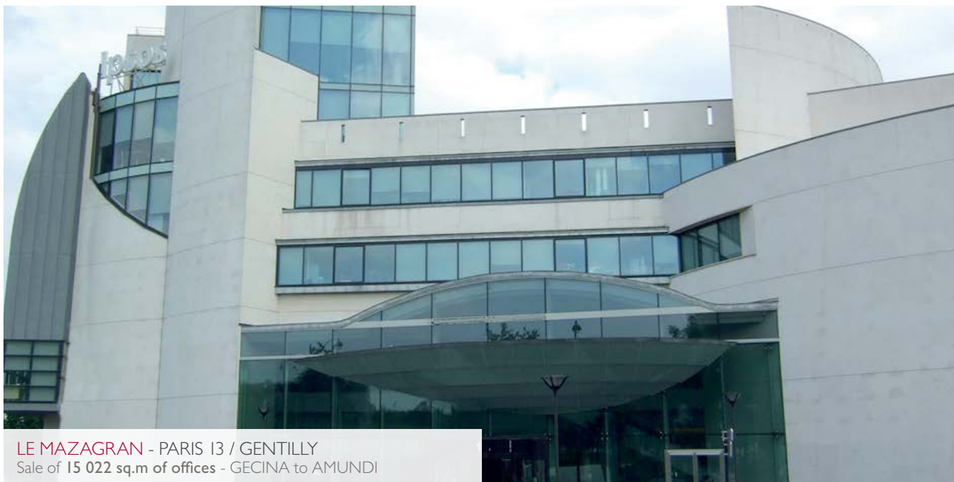
LE MAZAGRAN - PARIS 13 / GENTILLY Sale of 15 022 sq.m of offices - GECINA to AMUNDI