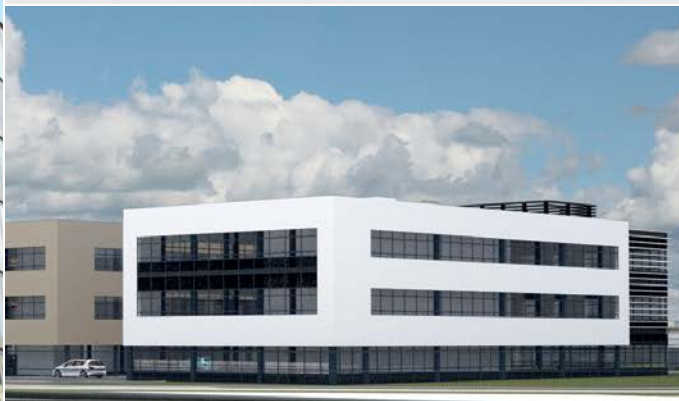
DCNS - BREST / GUIPAVAS Sale of 9181sq.m of offices ("VEFA") - LAMOTTE to MOORPARK