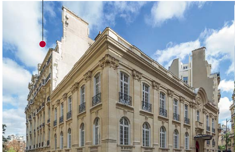
4-6 RUE DE LASTEYRIE - PARIS 16 Sale of 1 311 sq.m of offices - FONCIÈRE DE PARIS to CARMF