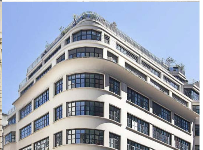
6 RUE BEAUBOURG - PARIS 4 Vente de 5 093 sq.m of offices and retails - LFPI to SOFIDY