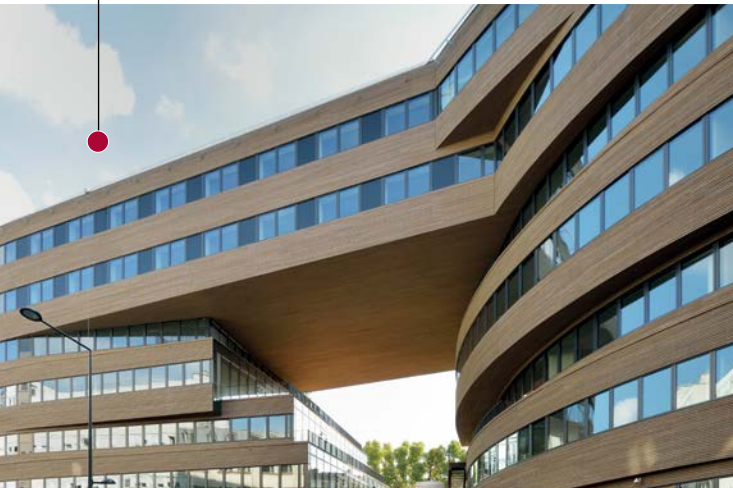
PUSHED SLAB - PARIS 13 Sale of 18 286 sq.m of offices- BANQUES POPULAIRES to AVIVA