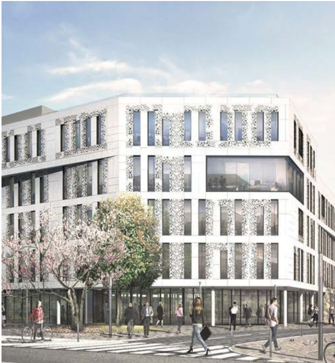
BONNE ENERGIE - NANTERRE Sale of 11 408 sq.m of offices ("VEFA") PRD to STANDARD LIFE