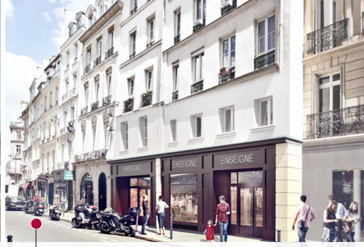
6-8 BD RASPAIL / 62-66 RUE DE GRENELLE - PARIS 7 Sale of I 519 sq.m of retail - EMERIGE to PRIMONIAL