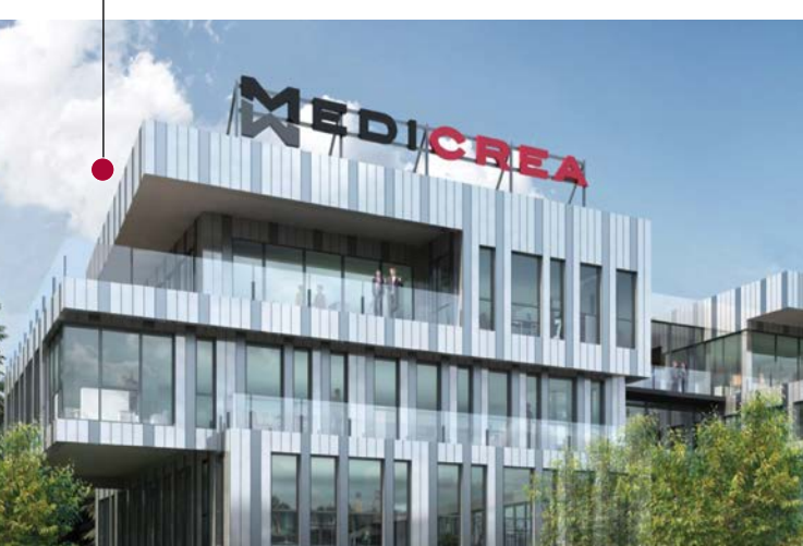
MEDICREA - RILLEUX LA PARE Sale of 7 783 sq.m of offices ("VEFA") 6<sup>èME</sup> SENS to MUTUELLE EPARGNE RETRAITE